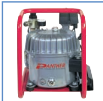
Service Kits - Pg. 488-492