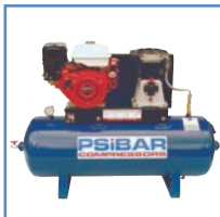
Engine Driven - Pg. 492