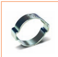
2-Ear 'O' Clips - Pg. 408