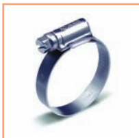
W2 & W4 Clips - Pg. 409-410