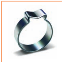
1-Ear 'O' Clips - Pg. 408