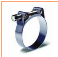
Supra W2 Clips - Pg. 411