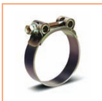
Super W1 Clips - Pg. 411